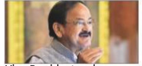
Vice-President and Rajya Sabha chairman M Venkaiah Naidu

PRESS TRUST OF INDIA New Delhi, December 4