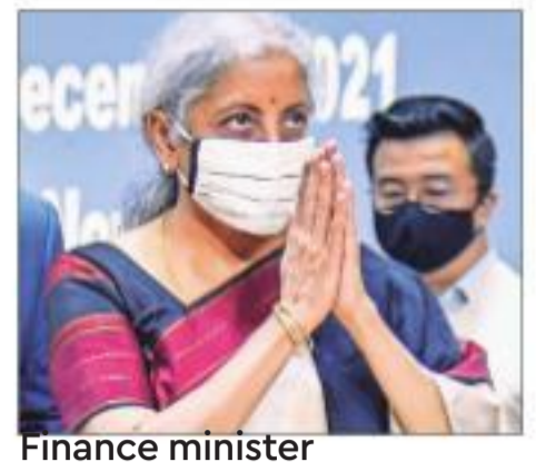
Finance minister Nirmala Sitharaman

FINANCE MINISTER NIRMALA Sitharaman on Saturday urged officials of intelligence wings to take every case to logical conclusion expeditiously, so that it can deter perpetrators of economic crime like smuggling.