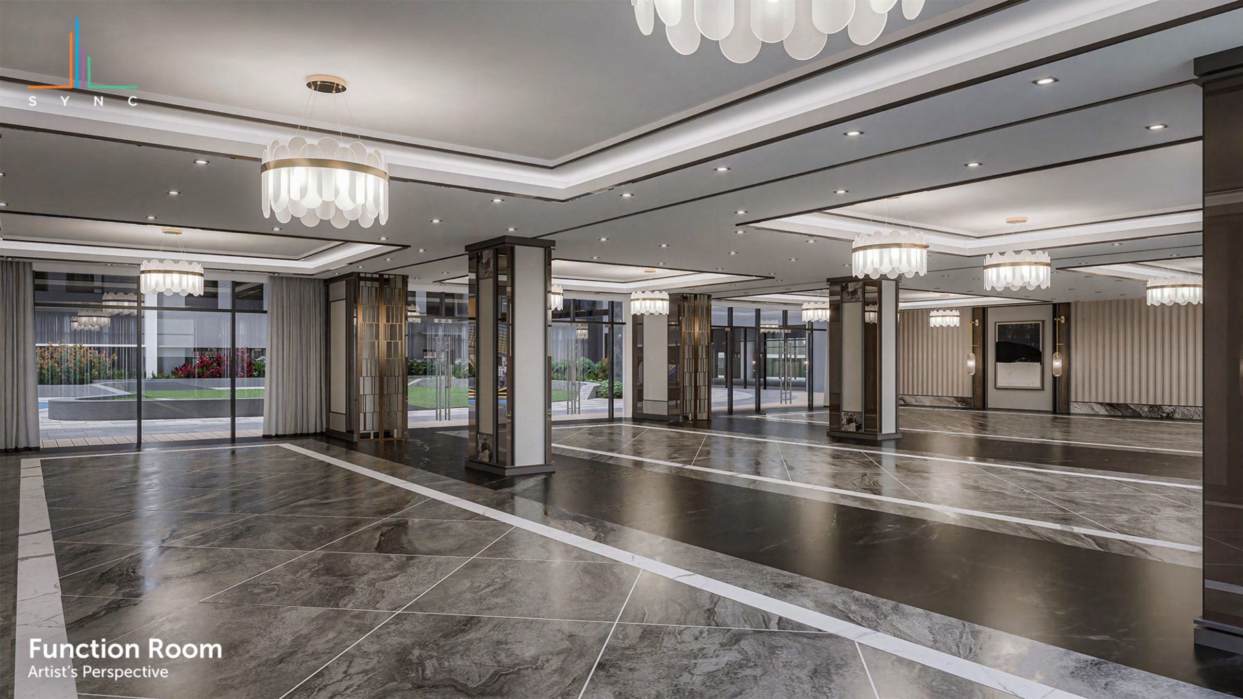
Function Room Artist's Perspective