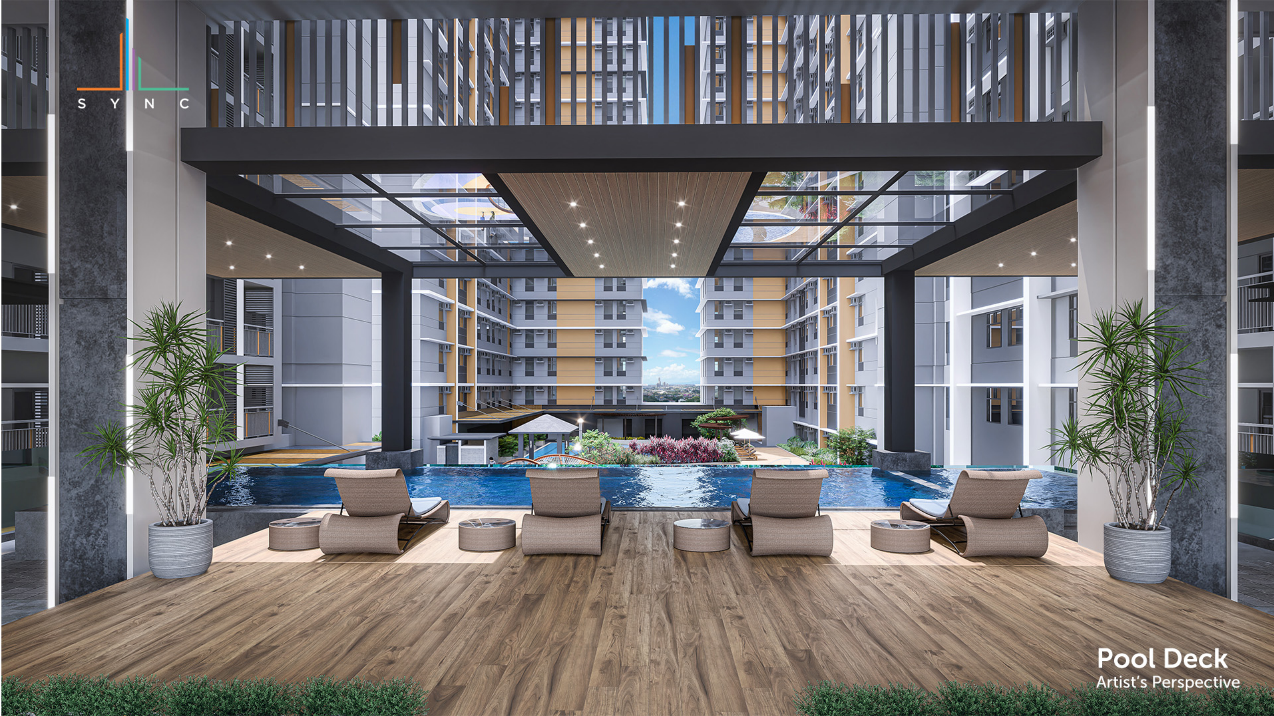
Pool Deck Artist's Perspective