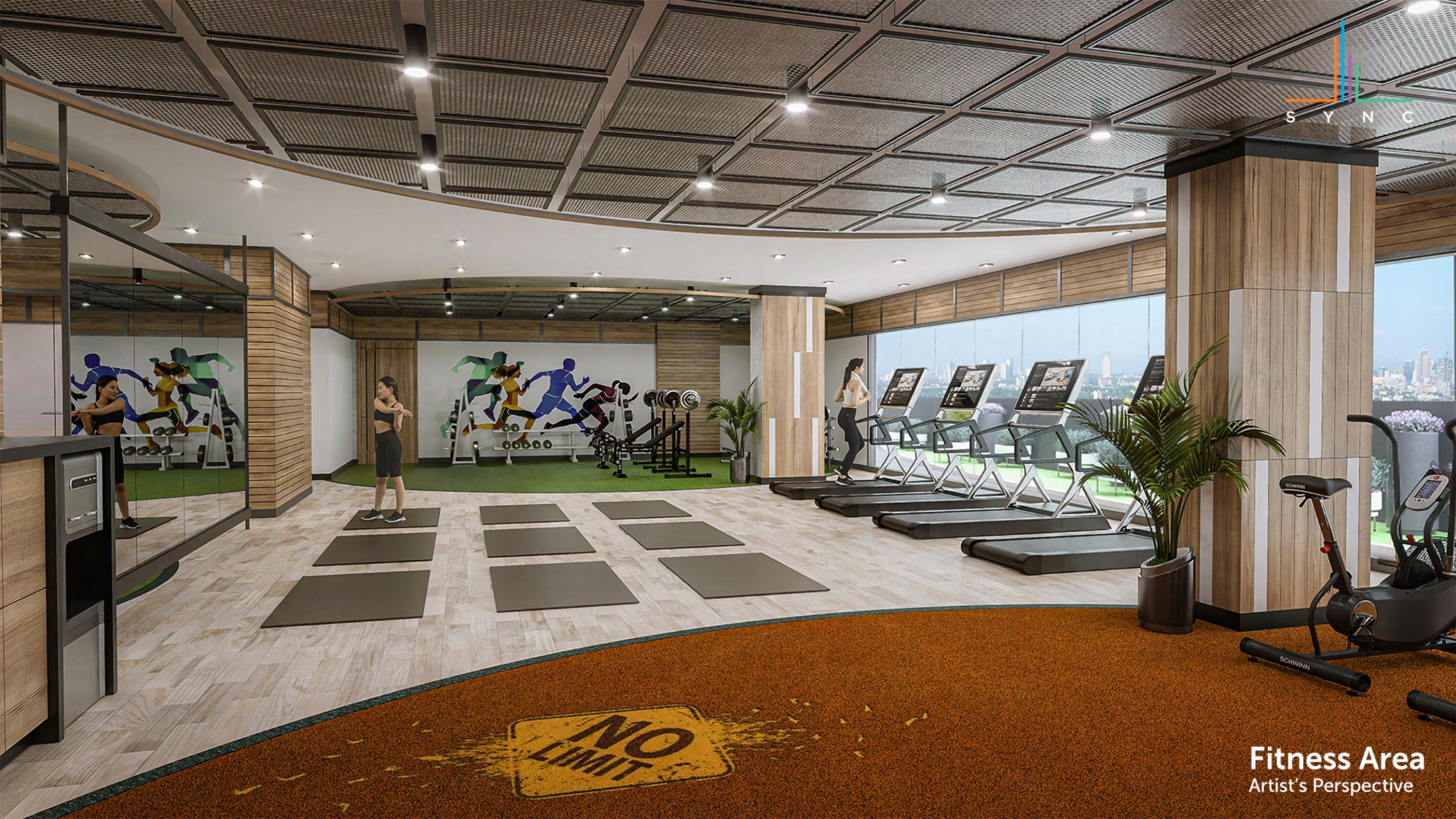
Fitness Area Artist's Perspective