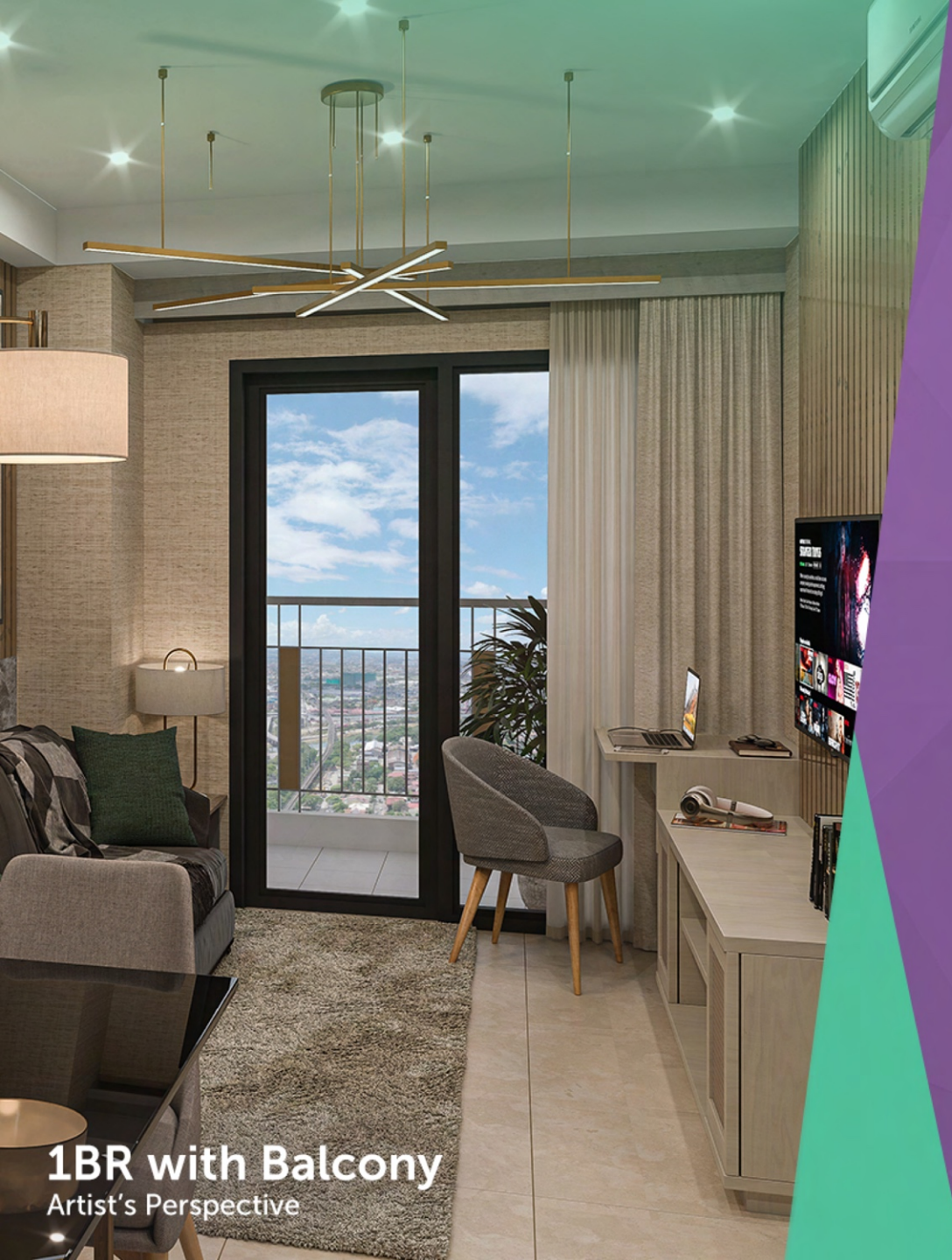
1BR with Balcony Artist's Perspective