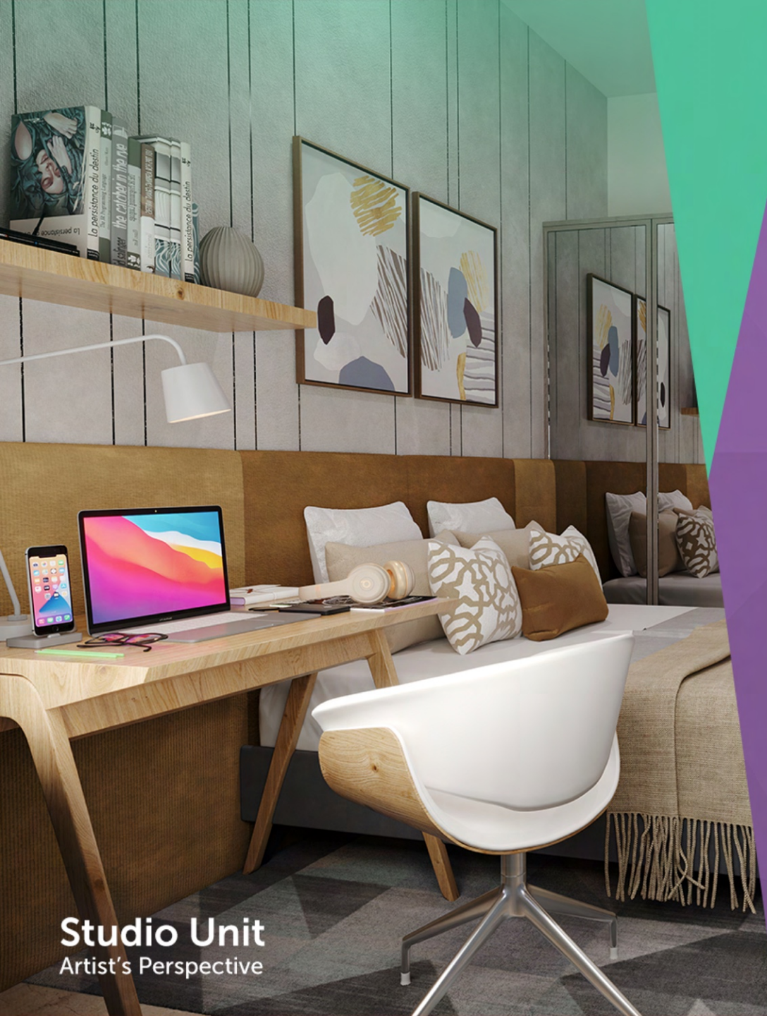
Studio Unit Artist's Perspective