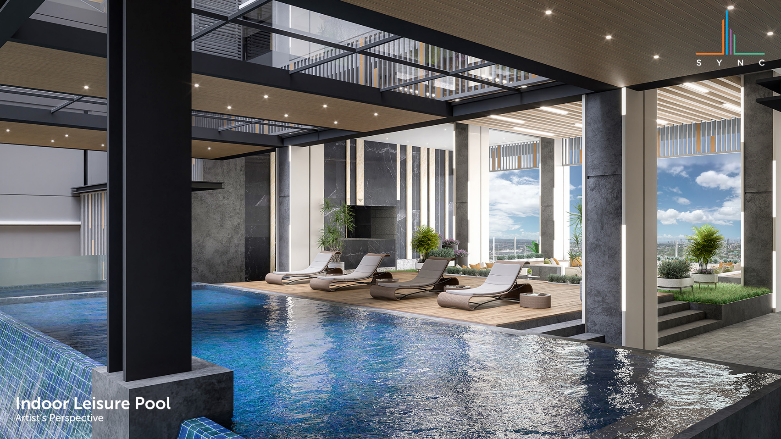
Indoor Leisure Pool Artist's Perspective