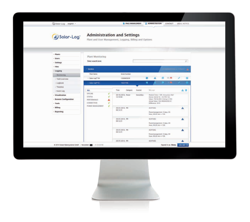
Benefits for Plant operator

Quickly identify underperforming plants by using central and concise plant monitoring. Easily manage plant alerts through the integrated logbook and ticketing system, reducing daily plant monitoring down to a single task. Better diagnostics lead to faster recovery and less downtime.