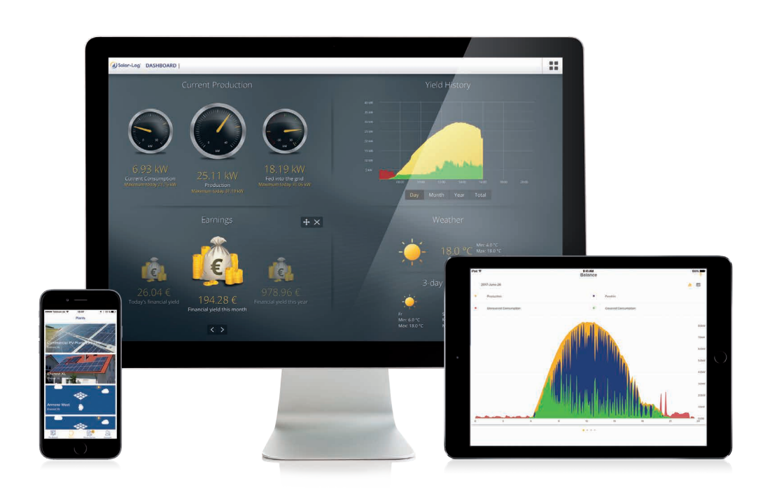
Solar-Log™ Dashboard and app Solar-Log WEB Enerest™

Installers, plant operators and service providers can impressively and customized showcase the photovoltaic plant's performance with an eye-catching display using the Solar-Log<sup>TM</sup> Dashboard. It displays various top-level data including production, CO_2 savings, financial earnings, and environmental aid. The Solar-Log<sup>TM</sup> Dashboard can be viewed as a slideshow and portal operators can customize slides by adding images or text. Plant information is also available through the new app Solar-Log WEB Enerest<sup>TM</sup> for iOS or Android.