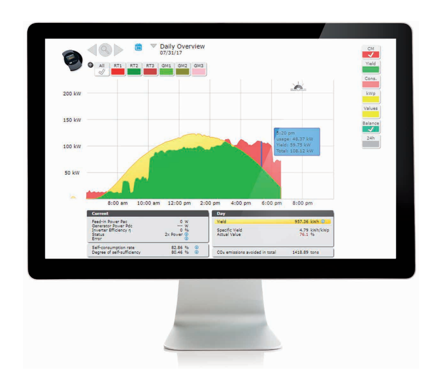
Daily Overview. View production, consumption, and feed-in information, and monitor and compare inverters and strings.

Daily, monthly and yearly plant overviews provide instant access to plant data from your desktop or mobile device. View production information, forecasted values, and easily produce comprehensive detailed reports. Reports can be downloaded in CSV or PDF form or automatically emailed to users.