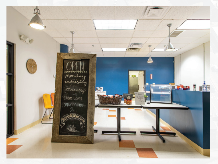
Walking Distance to Downtown Concord