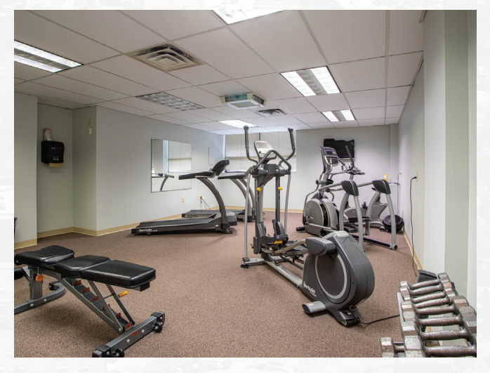
Newly Renovated Fitness Center