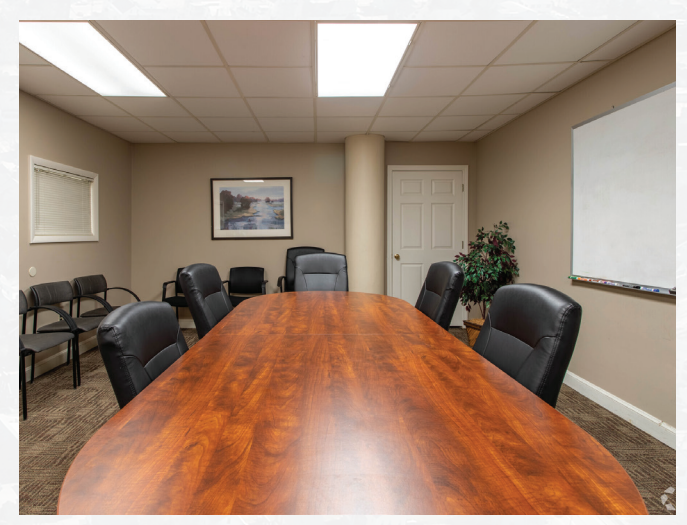
Shared Conference Room