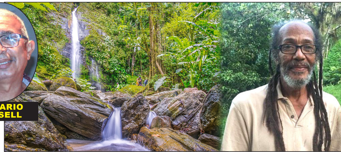
Double River Falls

able are freshly squeezed juices, delicious pastels, homemade cakes, sweets and ice cream.