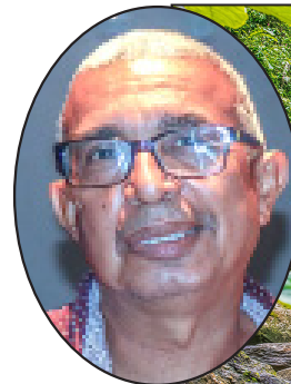
By MARIO RUSSELL

At the heart of the village, there is the Visitors Centre where avail-