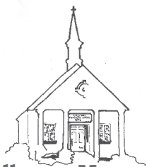
Holloway Memorial Chapel Founded in 1891