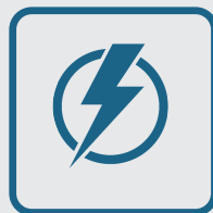
Oil, Energy & Power