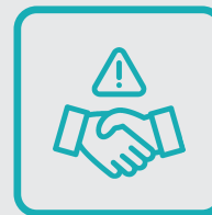
Political Risk Insurance (PRI)