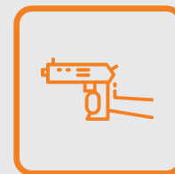
Terrorism & Political Violence