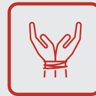
Kidnap & Ransom