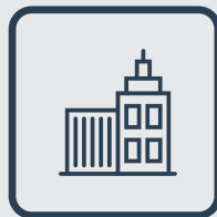
Operational Cover for Large Property