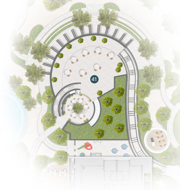
Clubhouse Upper Level