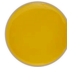
BAOBAB TREE SEED OIL

This ethically sourced extract is packed with hyaluronic acid and antimicrobial peptides that stimulate collagen and elastin production to counteract the visible signs of aging.