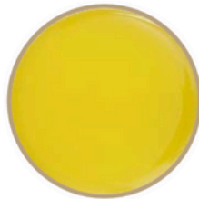
AFRICAN DESERT DATE SEED OIL

A natural antioxidant, grapeseed defends against free radicals that age the skin. It also gently exfoliates, and deeply nourishes.