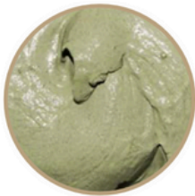
FRENCH GREEN CLAY (MONTMORILLONITE CLAY)

Our ingredients are selected for their natural benefits, effectiveness, and purity from partners in Africa, Europe, North America, India, and the rainforests of South America. Strictly adhering to the Nagoya Protocol and the Fair-Trade Act, we use sustainable and ethically sourced ingredients, including: