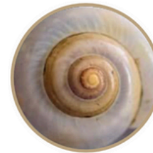
SNAIL SECRETION FILTRATE EXTRACT

This potent antibacterial ingredient is traditionally used in Ayurvedic remedies promotes healing and prevents uneven pigmentation.