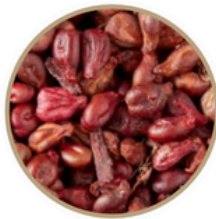
BURGUNDY GRAPESEED EXTRACT

As one of the most mineral-rich and detoxifying clays in the world, Montmorillonite Clay contains copper, zinc, iron, and magnesium, which play vital roles in skin health and performance.