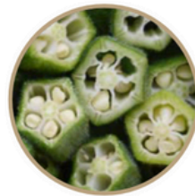
HIBISCUS ESCULENTUS FRUIT EXTRACT

Cold-pressed and rich in nourishing essential fatty acids and saponins that reduce inflammation, this oil helps regenerate and replenish. It penetrates quickly, leaving no greasy residue.