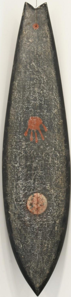
James Webb Bonzer Polyester foam 86" x 22" x 3" 2023 $2,500.00 USD