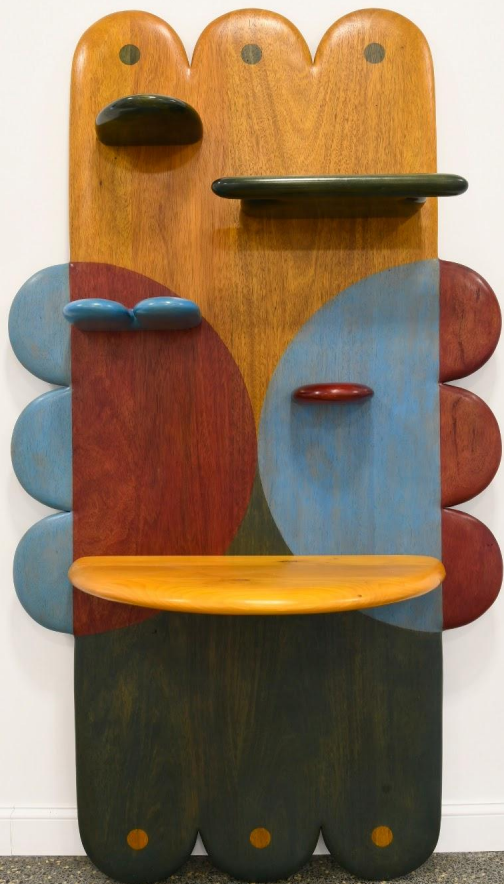
Pájaro Tornillo wood 30"x48"x84" 2022 $18,000.00 USD