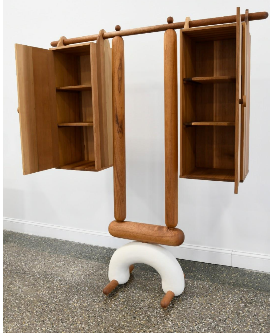
Yoke Mahogany, plywood, milk paint, cedar wood Dims Unknown 2024 $25,000.00 USD