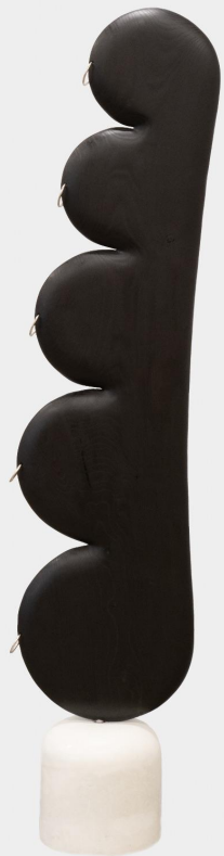
(Sculptural outfit display) Pierced Butternut wood 18"x18"x 80" 2024 $10,000.00 USD