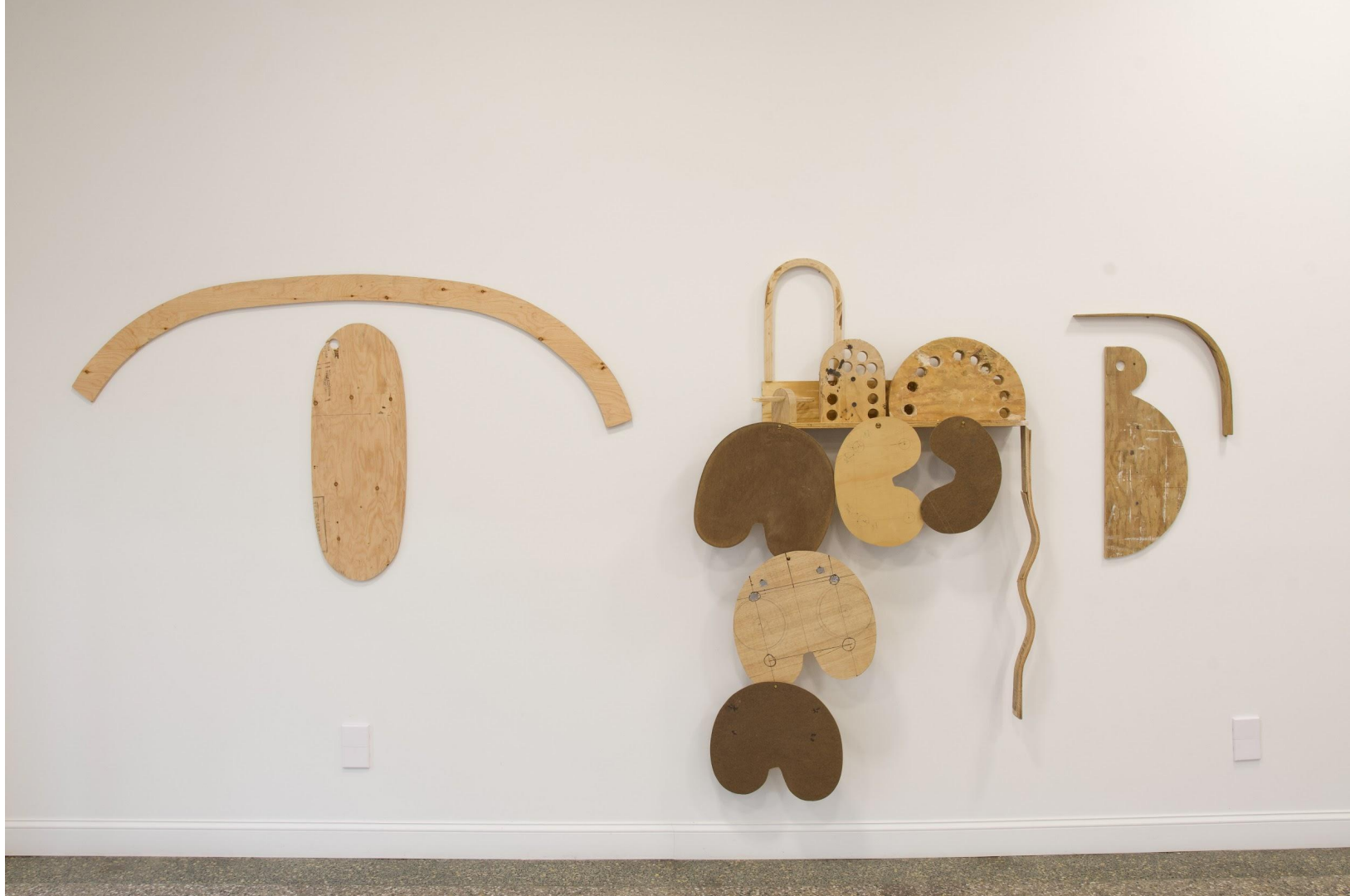
Templates Various boards 84" x 144" 2025 $20,000.00