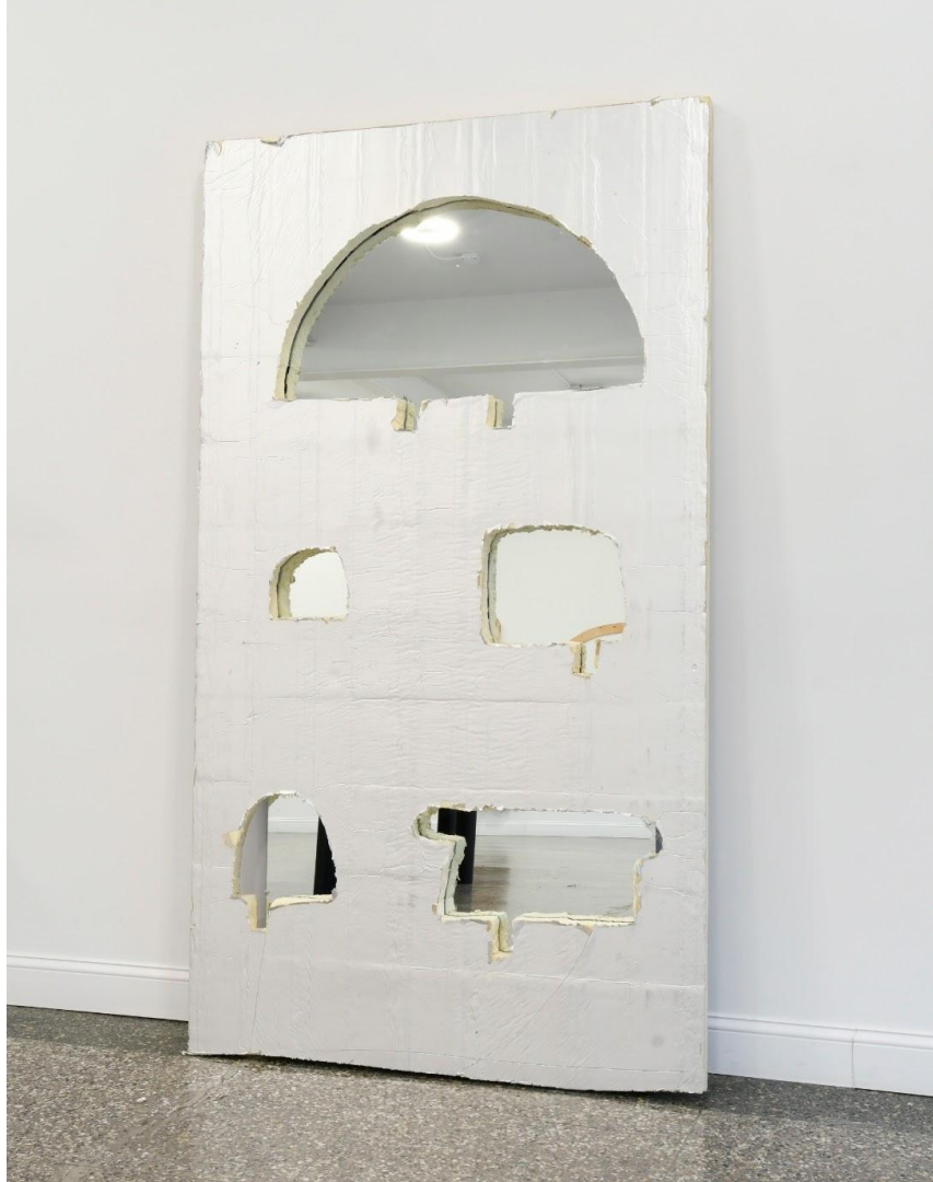
(Mirror) Lost in Transit polyurethane foam insulation board, mirror 48"x 96" 2022 $10,000.00