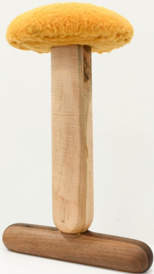
The Mono Stool Shearling, maple and walnut 30"x12" 2024 $2,600.00 USD