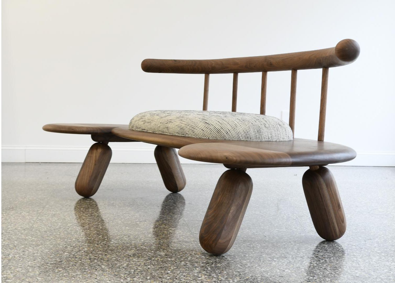
Checa Settee Materials Unknown 38"x84"x31" 2024 $20,000.00 USD