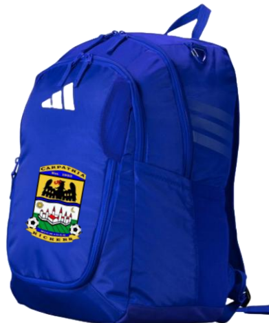
Adidas Stadium 4 Backpack