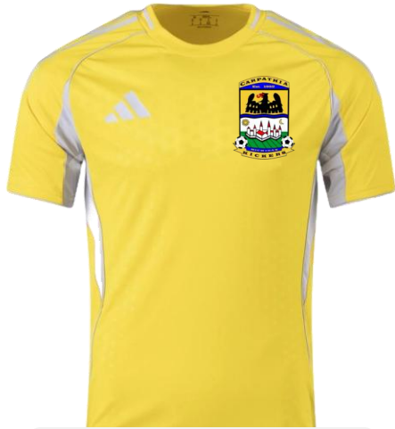
Adidas Tiro 25 Competition Match Day Top