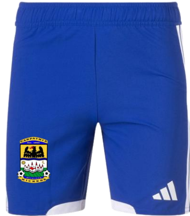
Adidas Tiro 26 Competition Match Day Shorts