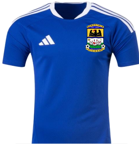
Adidas Tiro 26 Competition Match Day Top