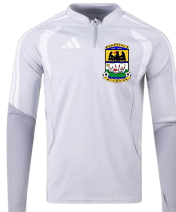
Adidas Tiro 26 Competition Training Top