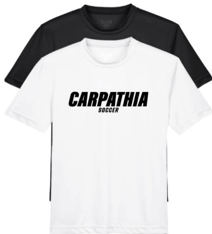
A4 Black & White Practice Shirts