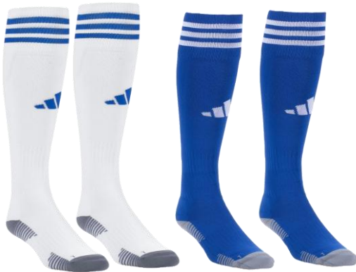
Adidas Copa OTC Socks White & Royal Blue