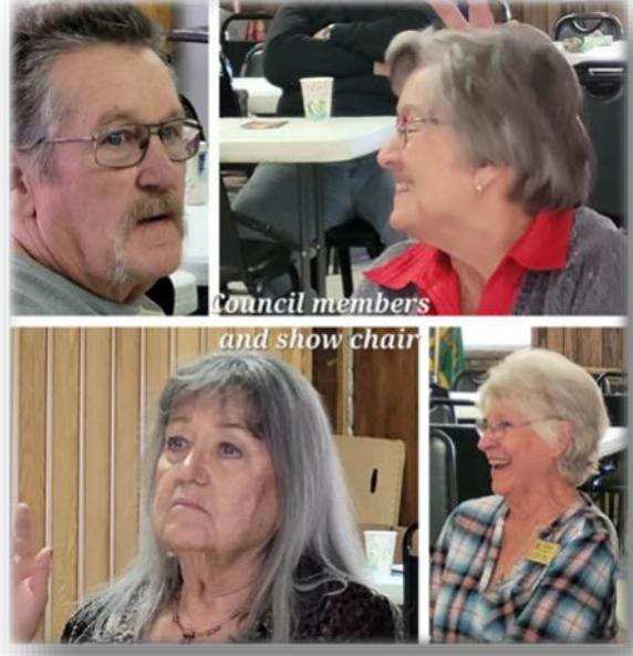
Council members and show chair