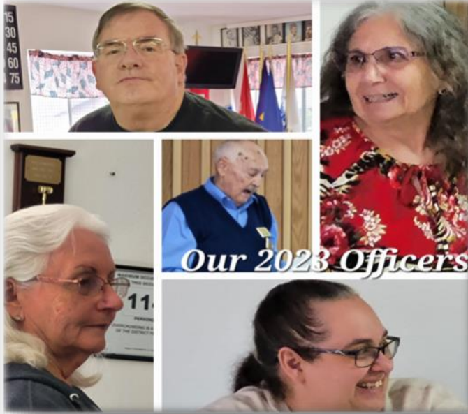
Our 2023 Officers