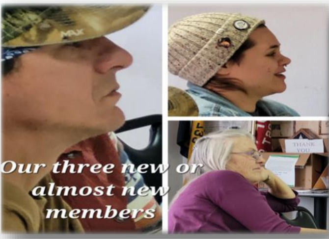
Our three new or almost new members