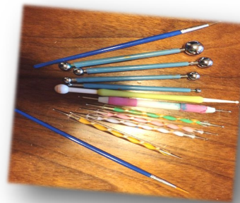
Mandala Tools to be used in the process