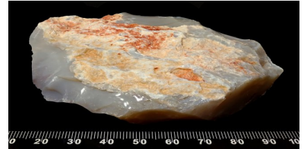
Common Opal, Nevada

Until recently, opal was considered to be an amorphous solid. Amorphous means that the material cooled too quickly for any crystal lattice (structure) to form. An example of an amorphous solid is obsidian, known as volcanic glass. It is now understood that opal is composed of microspheroids of hydrous silica, tiny round spheres of quartz and water. Thus the chemical formula of opal is \text{SiO}_2 \cdot n \text{H}_2\text{O} . It forms when silica-rich water fills underground cavities, often at the level of the water table.