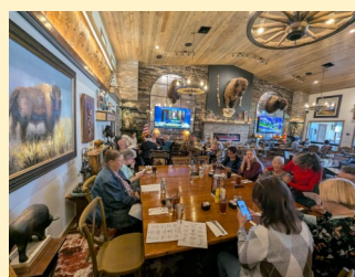
February Let's Do Lunch

The Let's Do Lunch Club will meet at Red Devil Pizza, March 26 at 12 PM. Address is 1774 E White Mountain Blvd, Pinetop-Lakeside, AZ.