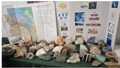
STEM Fair Display