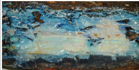
Precious Opal, Western Australia

Opal may be white, known as hydrophane, which, when immersed in water, becomes transparent. Opal can also be colorless naturally, blue, black, whitish, an appearance like porcelain or plastic (luster), red, brown, even have "fire" (fire opal), and more.