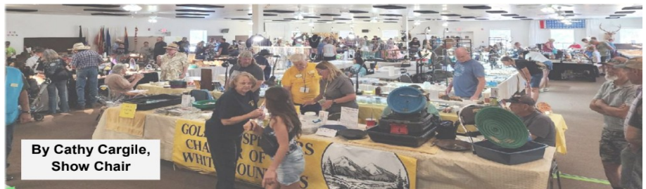
2025 White Mountain Gem and Mineral Club Annual Show