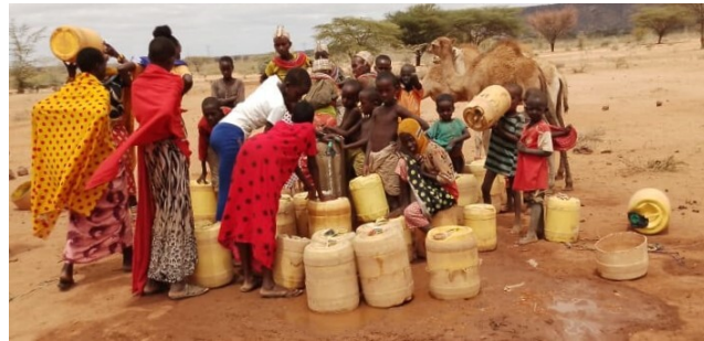
Water fetching at the Lolukushu borehole.

For decades, the residents of villages in Northern Kenya have been walking for miles in search of water for their personal use and their livestock. The residents are pastoralists who rely mostly on their livestock for food and income. The region has been experiencing drought due to long periods of no rain; often lasting up to more than three years.