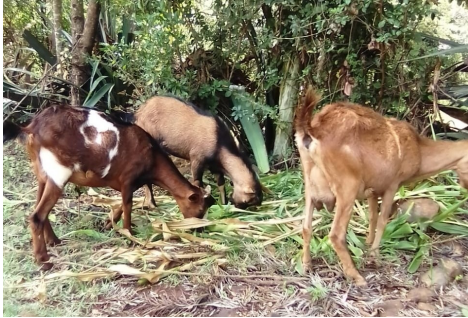
The Nyahururu Expert's goat project.