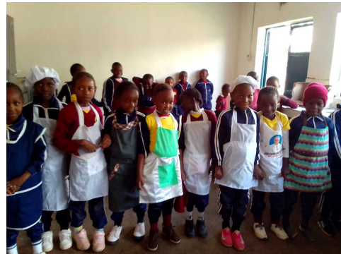
The Grade two home science class students.

In July 2023, the students engaged in various projects in their respective grades. The projects saw them cook various meals, carry out computer projects and participate in music and sports.