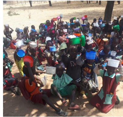
A Nkalup preschool children enjoying a meal

Samburu County is 80% illiterate due to their nomadic life resulting in many children missing an opportunity to have formal education. In the Nkalup pre-schools, there are children as young as 2 years as well as older kids who are over 10 years. This is a result of primary schools being too far from home. Parents take advantage of the situation by sending children to herd their animals. The children unable to take good care of the cattle are termed foolish and are taken to school.