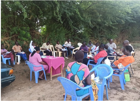
Ongoing class in the Lchamus campus.