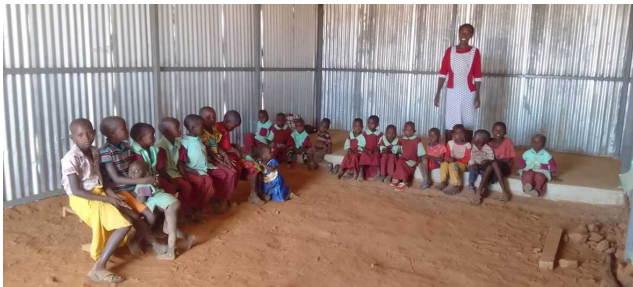
Some of the children at the Naupanguruki Preschool.

We love you! We appreciate you! God bless you!