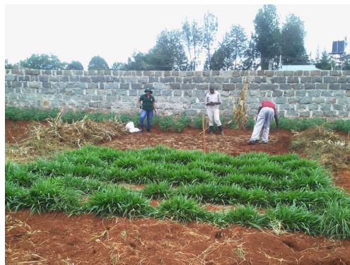
Planting ongoing for the GGFAN Agri Expo 2024.

Agriculture is the major income-generating activity in Kenya not only to the farmers but also to those working in the agro-based industries. We are striving to transform communities by training them on how to employ modern and effective farming methods to ensure maximum yield that translates to employment and better incomes.