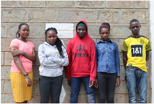
The KCPE candidates from HOTGS.