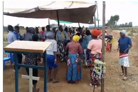
The GGFAN OI Moran church.

GGFAN envisions Kenya as a country where God is worshipped by all the tribes. As our vision states, 'That all the 122 tribes of Kenya would have access to the Gospel of God's love'. As of 2023, we are working among five major unreached people groups in Kenya namely Samburu, Turkana, Pokot, Lchamus, and the Rendile. Among the five tribes, the Samburu is the most impacted tribe.