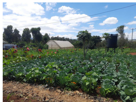
The HOTGS Garden.

Our goal as a department is to ensure that the people we are reaching with the Gospel have a sustainable life like Jesus wishes for them through agricultural empowerment. This empowerment results in the production of food for our children and congregants as well as the generation of income.