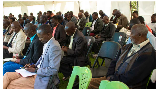
GGFAN men congregated for the seminar.

In Africa and the world at large, gender empowerment has focused mainly on women. Men have, on many occasions, been overlooked due to the stereotypical belief that they are strong beings who show fewer emotions. Most of the empowerment seminars conducted, even by GGFAN, have targeted women to enlighten and empower them to take up leadership and responsibilities. Men are considered as the breadwinners and problem solvers hence, there are no education programs organized for them.