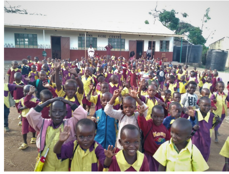
Huruma ECDE children.

The academic year for schools in Kenya began on January 9th, 2024. This year in the eighteen pre-schools under Samburu County Nkalup Vision (SCNV), there has been a significant increase in enrollment as compared to previous years where there were low turnouts during the first week. Although some children have left the preschool to join Grade One in other primary schools, the current enrollment stands at over 1,200 students.