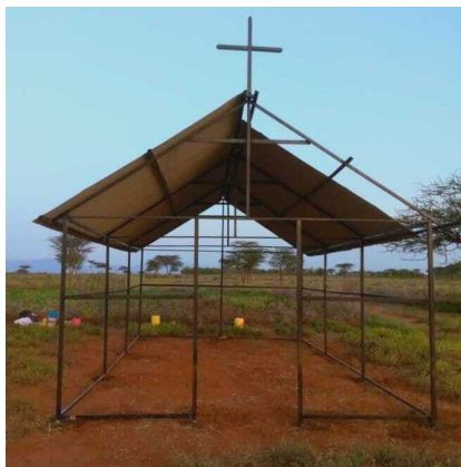
EAPC Bendera Preaching Point!