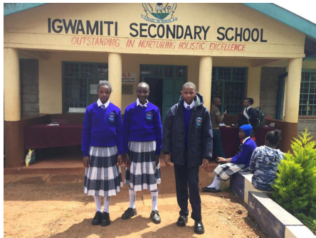
HOTGS children admission.