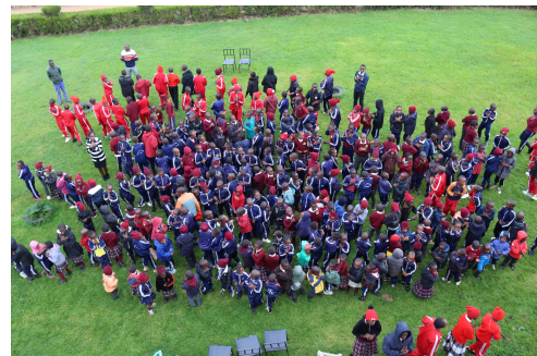
The LLA Opening Prayer Assembly.

At Little Lambs Academy (LLA), we are committed to providing holistic education to help create the next generation of Kenyan leaders. Our curriculum is structured in a way that ensures that all