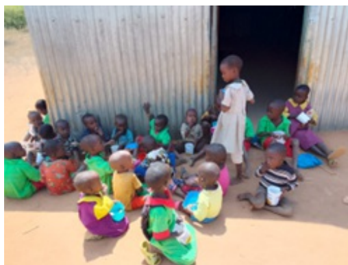
Nolderkes Pre-school in Ng'iro Division studying in a SCNV Church building.

Samburu County Nkalup Vision (SCNV) Education Program is challenging and complementing the role of the Samburu County Government in the provision of basic education in Samburu. The SCNV program started with six schools in September 2018 and has now increased to eighteen preschools in the six divisions of Samburu County. Each division has three preschools that are funded by SCNV. The preschools started in the SCNV-constructed church buildings which children could easily access since government most of the schools are far from their homes.