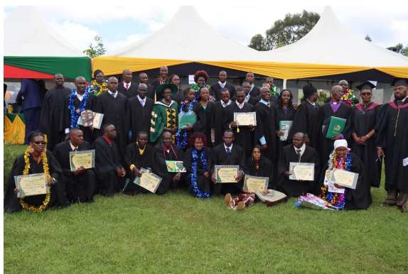
The Nyahururu Campus graduating class of 2024.