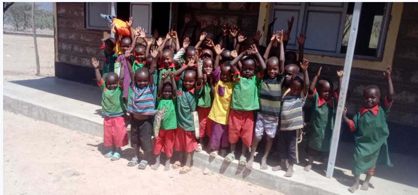
The children at the Nadokuliponi Preschool South Horr, Samburu County.

The current drought situation in Samburu has led to most of the grants from the SCNV partners being used in nine NKALUP relief food missions. The drought was preceded by the locust invasion which came after the COVID-19 pandemic. This has led to a lack of enough funds to support the preschools and stipend teachers Thank you for your contribution that helps to not only make the Gospel accessible but also offers a chance to provide education to children in Samburu.