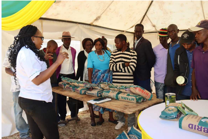
An exhibitor from Kenya Seed Company training farmers on the use of quality seeds during the GGFAN Agri show.