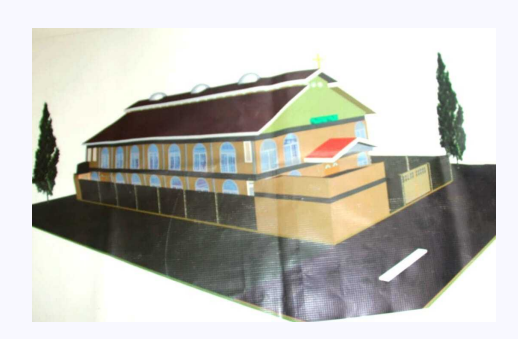
The GGFAN Maili-Sita project's architectural drawing.

GGFAN continues towards realizing its vision of making the Gospel accessible to the 122 tribes of Kenya. Our mission is to building powerful congregations that are able to meet the physical and spiritual needs of the unreached, least-reached, and the lost. We continue to work crossculturally to develop and empower