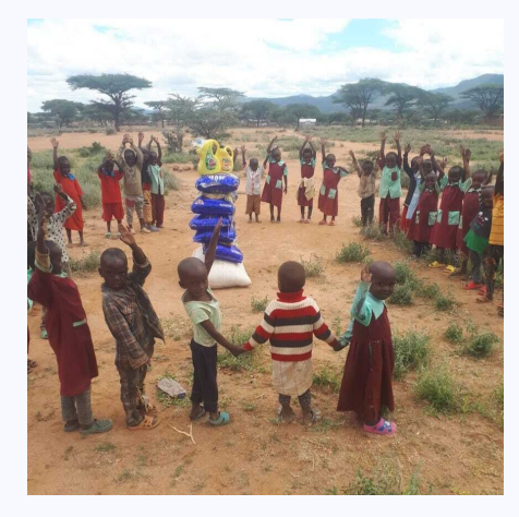
Children in the Naupa Nguruki NKALUP ECDE in Wamba celebrate after receiving the relief food.

The St. Michael's Anglican Church in Charleston has offered the Samburu County NKALUP Vision (SCNV) preschools a relief feeding grant that will help to feed over 1000 children for a three-month school term. The grant will help to keep hundreds of children in the seventeen SCNV preschools spread all over Samburu County.