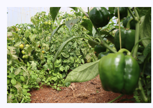
Our tomato and capsicum plants.

The GGFAN Agriculture Department continues working towards its vision to promote self-sustainability to the people