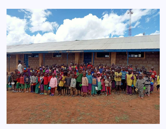
The 176 children in the Morijo ECDE preschool in Baragoi Division.