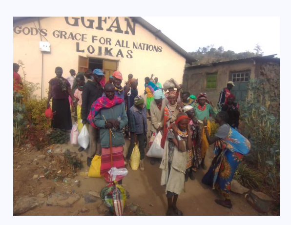
Villagers leaving the GGFAN Loikas Church after receiving a share of the relief food.

The Samburu County NKALUP Vision (SCNV) has been helping to feed people by conducting eleven rounds of relief feeding programs. The eleven rounds have cost 26, 540, 548 Kenya shillings and fed more than 28, 995 people for 868, 649 meals. The feeding programs have been conducted as a result of