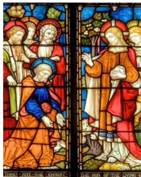
The William P. Irwin Memorial Window, Chancel of St. Peter’s Episcopal Church, depicting the Confession of Peter, “Thou art the Christ, the Son of the Living God.” (Matt 16:16-18, KJV)