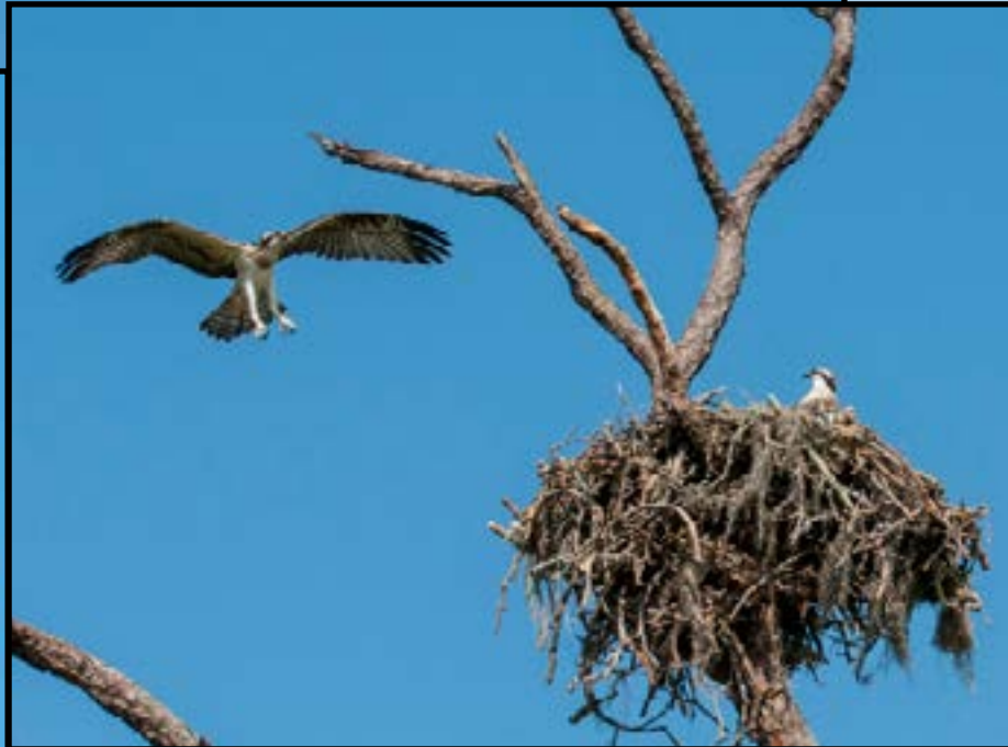
Osprey family near Cottages