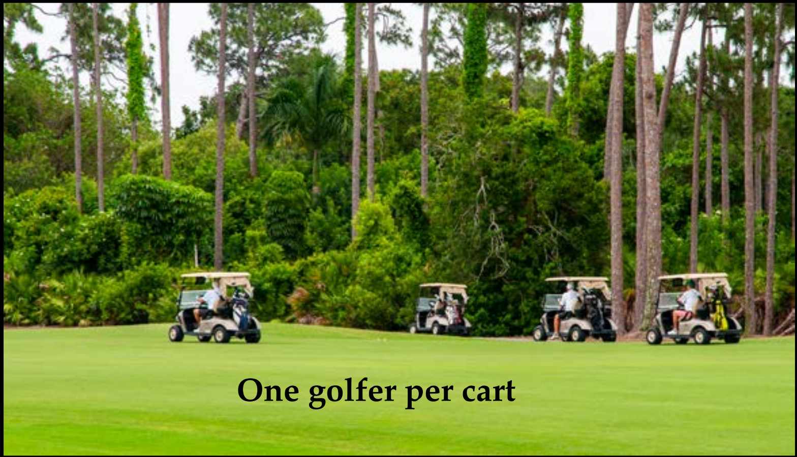
One golfer per cart