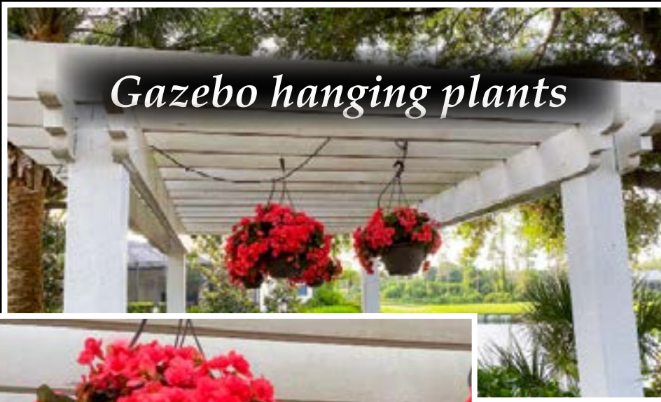
Gazebo hanging plants