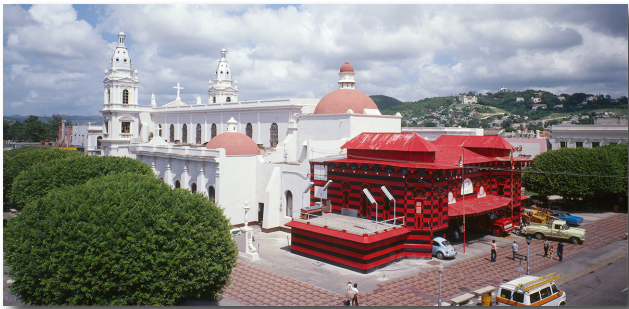
Ponce Cathedral and Fire Hose