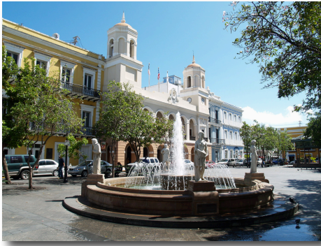
Arms Plaza in Old San Juan