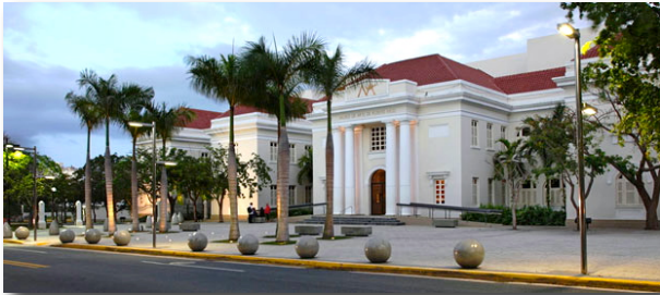
Puerto Rico Museum of Art