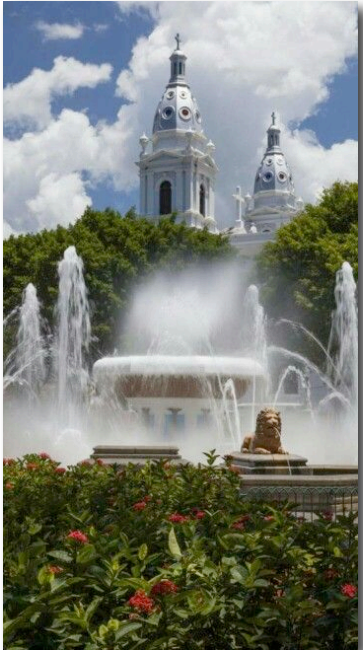
Las Delicias Plaza in Ponce