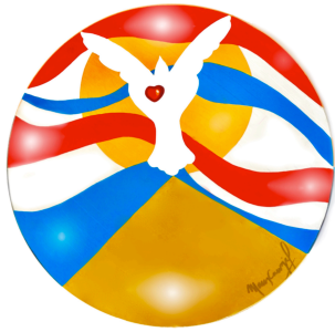
Journeys to Cuba and Puerto Rico