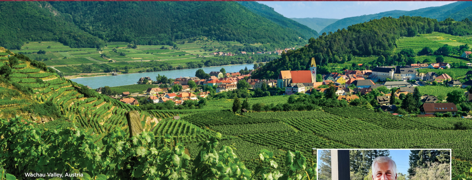
Wachau Valley, Austria

Uncork local traditions, savor intense flavors and enjoy palate-pleasing adventures during an AmaWaterways Wine Cruise