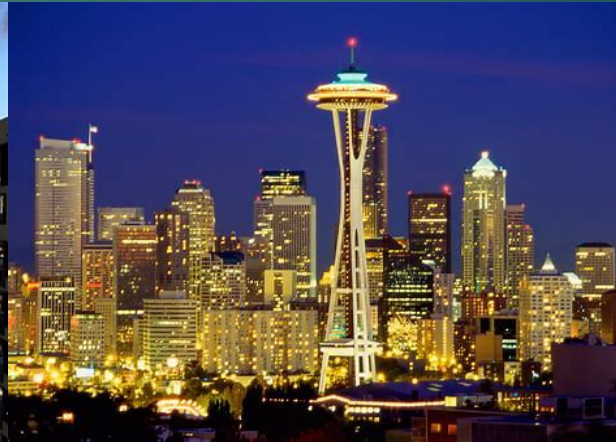
Seattle , WA