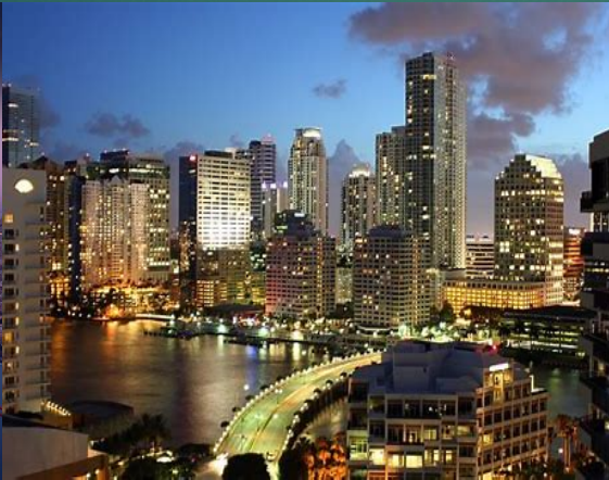
Miami , FL