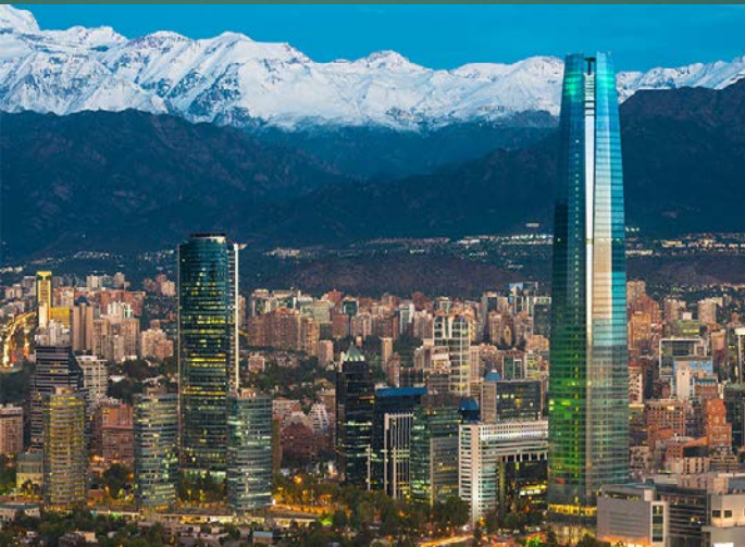
Santiago de Chile