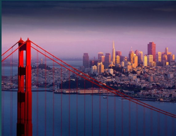
San Francisco, CA