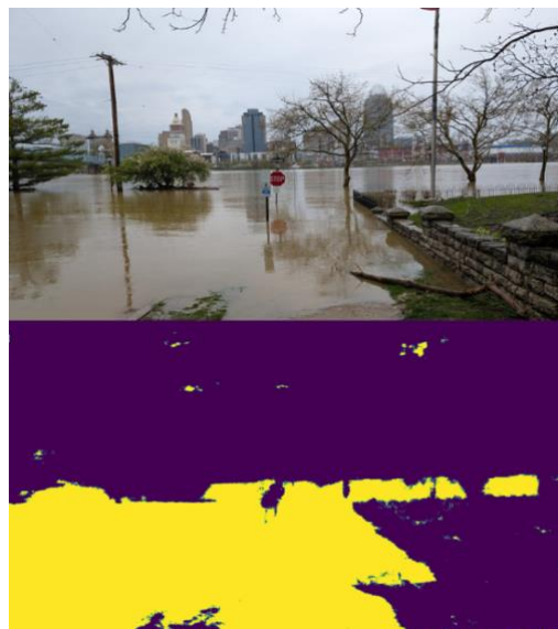
Fig. 2 Flood Detection Using Advanced AI