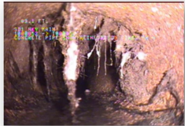
Figure 2. The CV model predicted Pipe Collapse (XP) and Root Fine Joint (RFJ) defects that were missed by humans