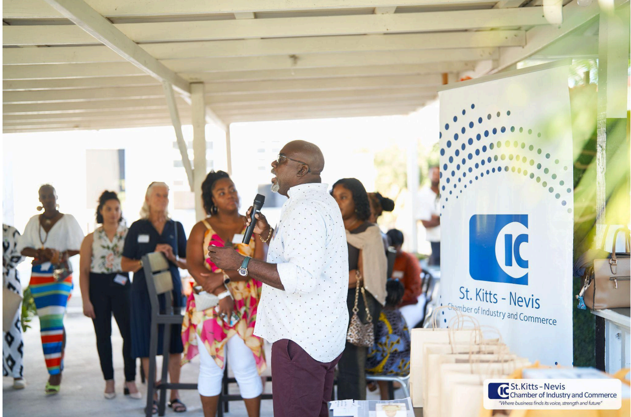
(Pictured: Chairman of the Nevis Division and SKNCIC Board Director, addressing the guests)