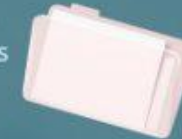
Figure out your evacuation route

Make sure documents such as insurance cards, IDs and other pertinent information are placed in a secured water-proof container.