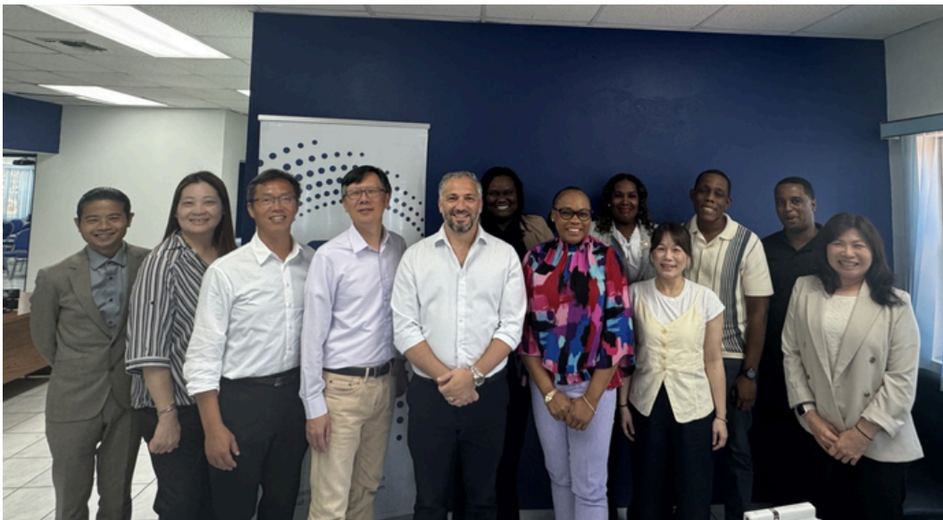
Delegation from TaiwanICDF, Representatives from Park Hyatt St. Christophe Harbour, Belle Mont Farm/Kittitian Hill and Carombola Beach Club.

The Chamber is pleased to share that a delegation from TaiwanICDF, including representatives from the National Kaohsiung University of Hospitality and Tourism, Ming Chuan University, and Hungkuang University, will visit St. Kitts and Nevis in May to explore cooperation opportunities in hospitality management and culinary training.