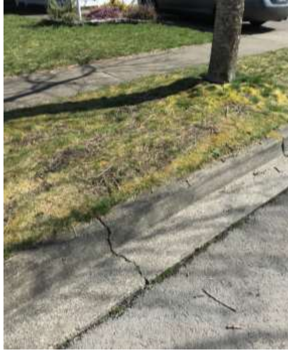
Photo of Typical Damage with Red Maple