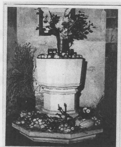
The font decorated for Harvest Festival sometime in the twentieth century.

Our evening finished with a photo of Whilton bell ringers ringing in the Millennium on 1 st January 2000.