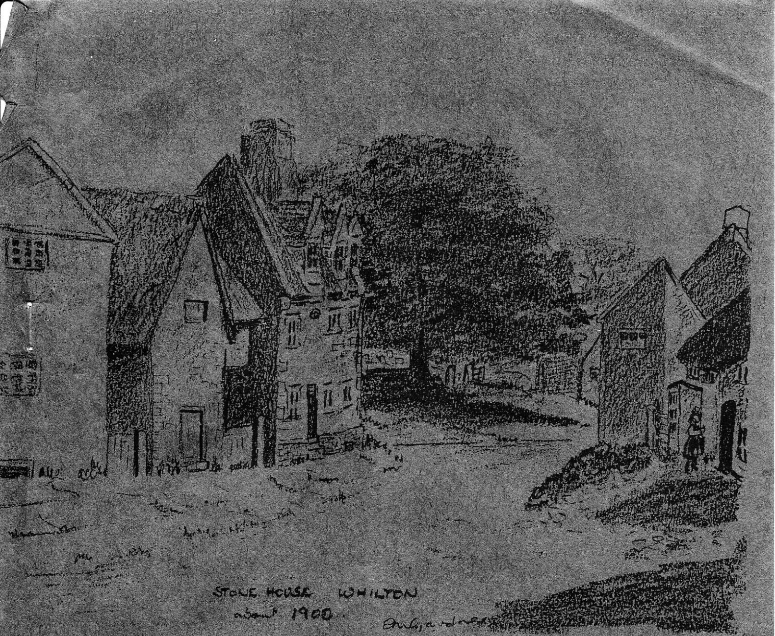
STONE HOUSE WHILTON about 1900