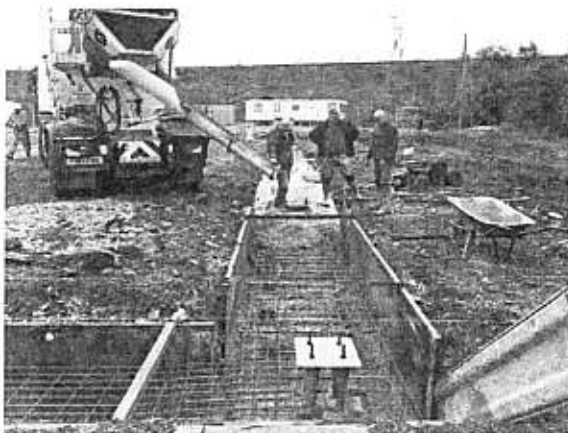
This picture shows the footings going in for the new workshop building.

A new wharf is being constructed to allow the Wise Hoist to manoeuvre over the water and lift out narrowboats when surveys are required. This will enable us to react a lot more quickly to our demands on site, which will speed up the sales process.