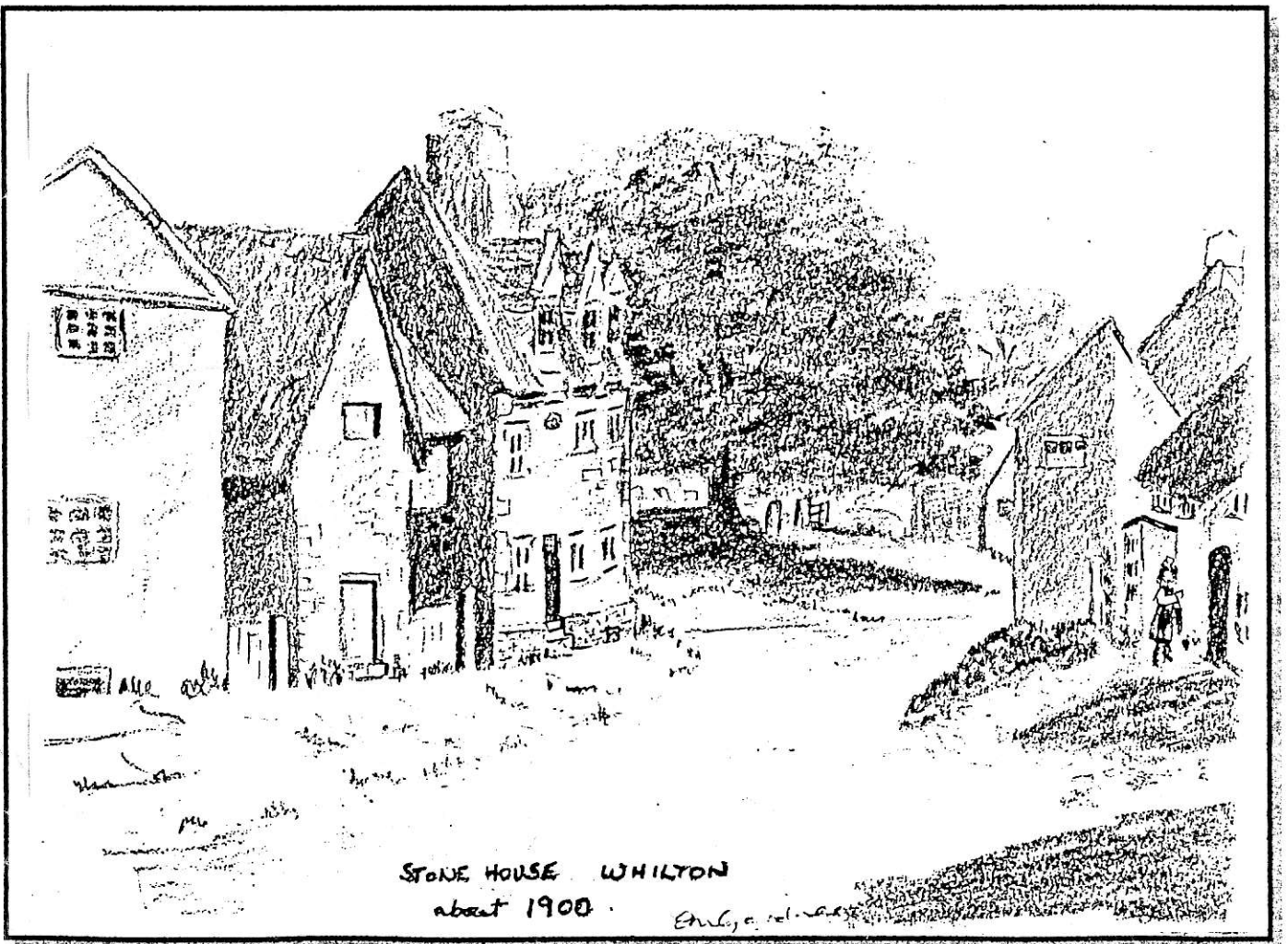
STONE HOUSE WHILTON about 1900