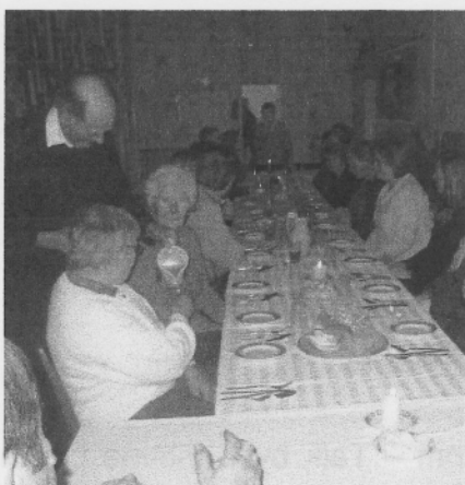
Drinks are poured before the meal

The first course was leek and rabbit soup, providing a flavour of the medieval winter cooking pot, which hung over the fire. Every cottager had his own piece of garden, which was cultivated to produce essentials for the family. Onions were grown throughout the country, as were leeks.