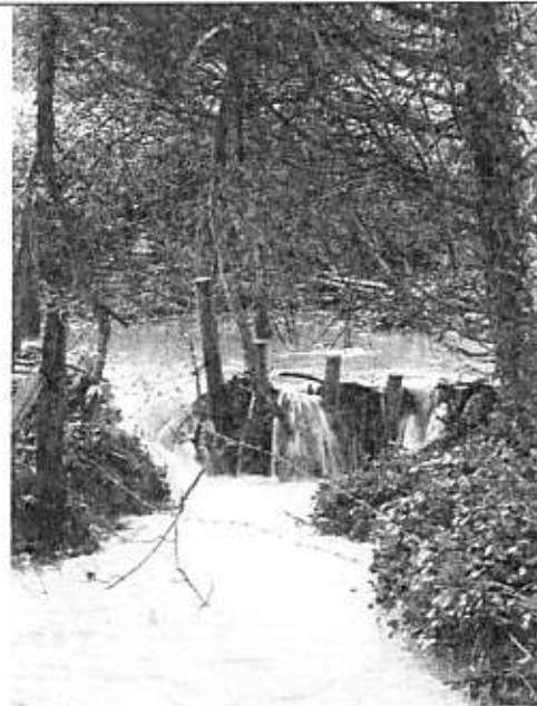
The stream in full flood, February 2020