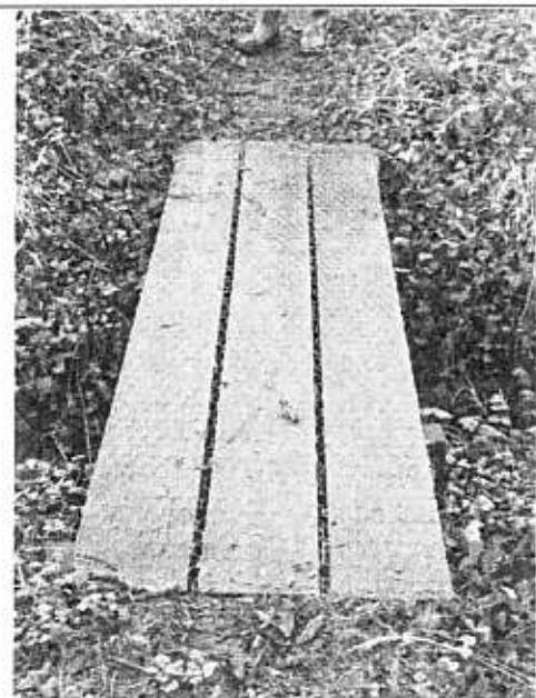
The newly wired bridge