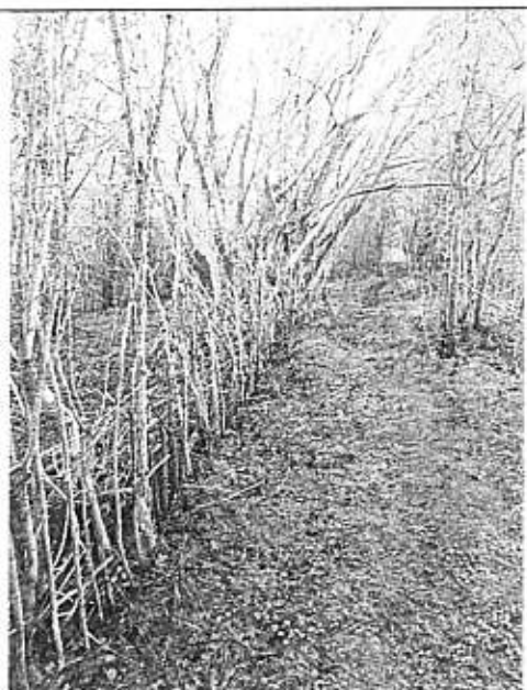
The start of the new dead wood hedge