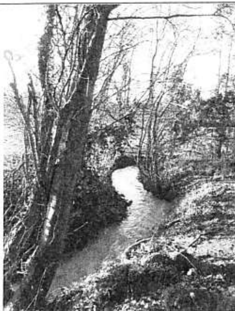
The stream flows freely