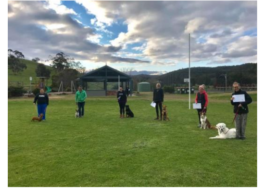
Level 2 – Group Photo

★ Sometimes a single private lesson is needed first for difficult dogs before joining groups. ★