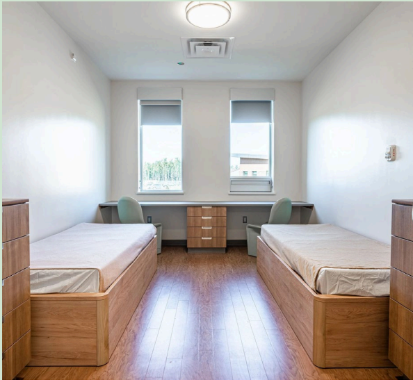
Shared Treatment bed space for co-support