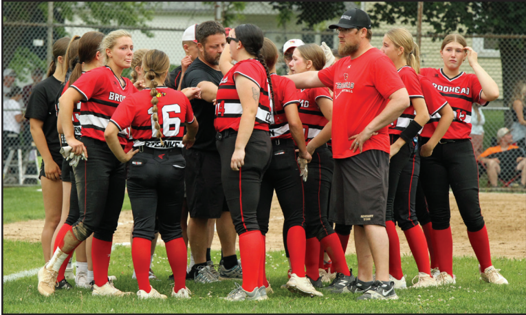
The Brodhead softball team has their final huddle of the season after the sectional semi-final game.