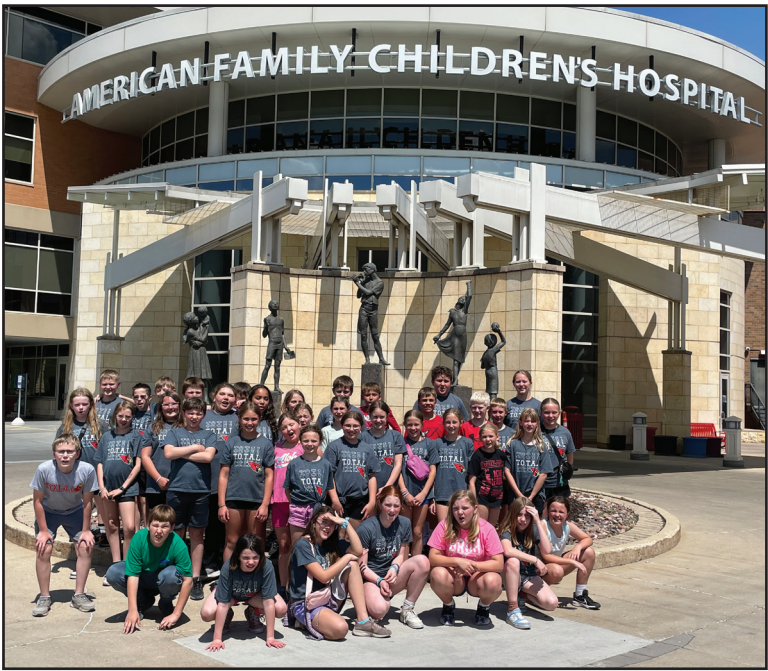
Albrecht Elementary School’s TOTAL team took a field trip to Madison on Wednesday, May 14th to drop off fund-raiser checks—$285.44 was donated to the Ronald McDonald House from the pop tab collection in January and $210.19 was donated to the American Family Children’s Hospital from Caps for a Cure in March. The group also enjoyed some rock climbing at Boulder’s Gym and lunch at Culvers.

and sounds of a bygone era. Doors open at 5:30 p.m. Free dance class starts at 6 p.m., and the band begins at 6 p.m. until 10 p.m. Food truck will serve throughout the evening. Whether you dance or just like to watch, this family-friendly event is a winner! Tickets are $30 ahead or $35 at the door, $15 for kids, $5 discount for veterans. Tickets can be purchased online at www.kelchmuseum.org or by calling the museum at 608-897-1175.