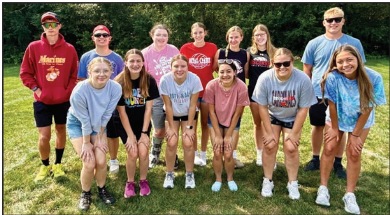
Pictured are some of the senior band members.