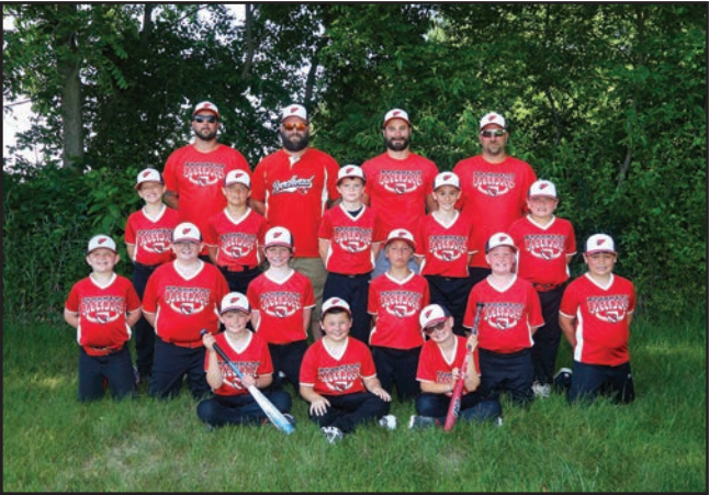
10U Boys—Brodhead 1 Sponsored by Covert Electric