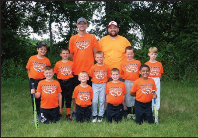
8U Boys—Brodhead 2 Sponsored by EXIT Professional Real Estate