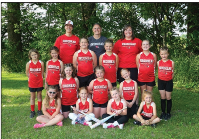
8U Girls—Brodhead 2 Sponsored by Menehan Refrigeration