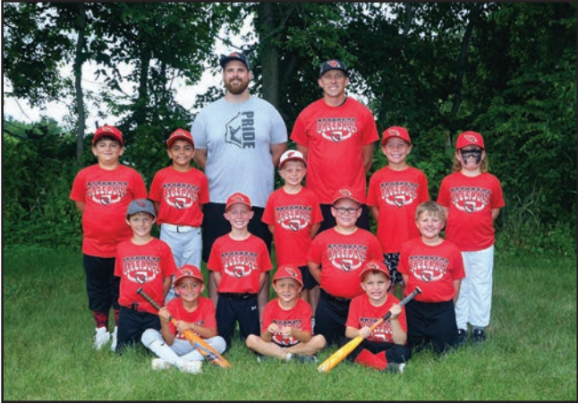
8U Boys—Brodhead 1 Sponsored by Arn's Auto Service