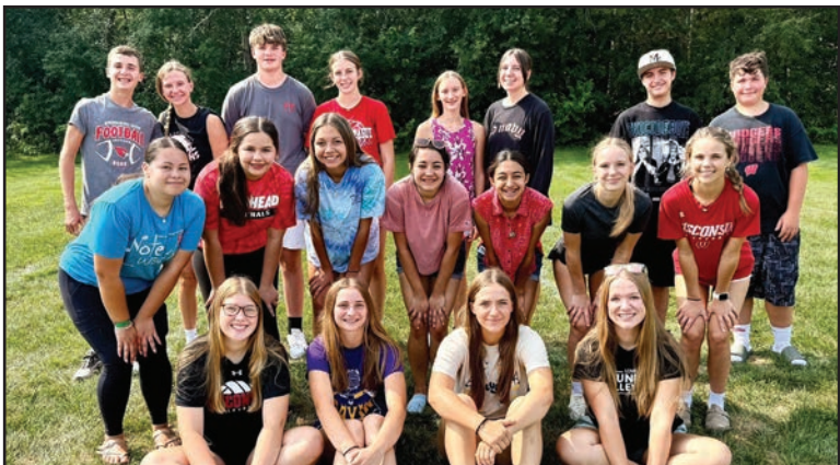
We love how many siblings we have in the Brodhead Band program. Here are a few sets of the siblings involved.