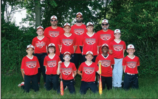
12U Boys—Brodhead 1 Sponsored by Menehan Refrigeration