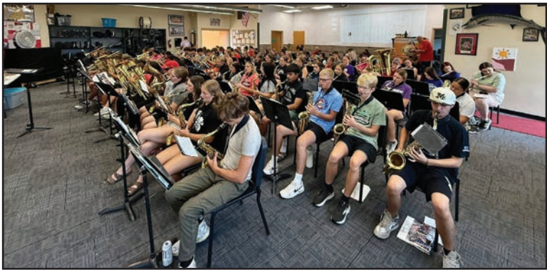
The students practiced a lot of music throughout the week.