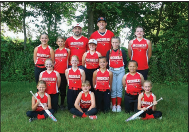
10U Girls—Brodhead 1 Sponsored by Speich Oil