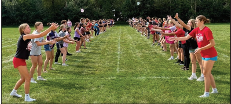
One of the highlights of the week is always the water balloon toss on the last day of camp.