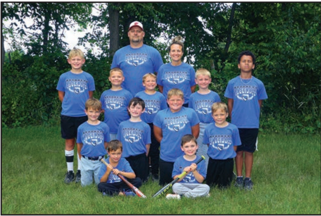
8U Boys—Brodhead 3 Sponsored by Bullwinkles