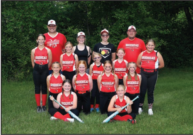
10U Girls—Brodhead 2 Sponsored by Harvest Moon