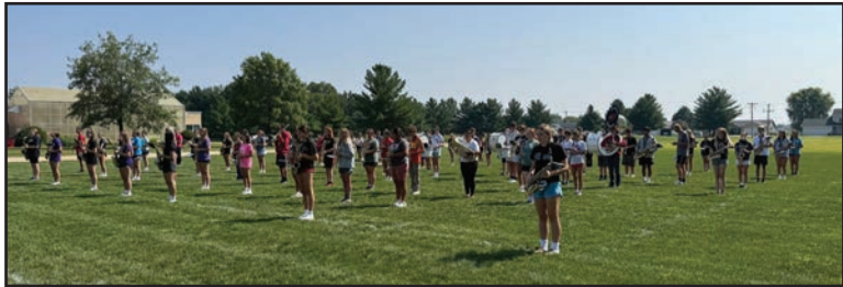
The students learned a lot of moves on the field.