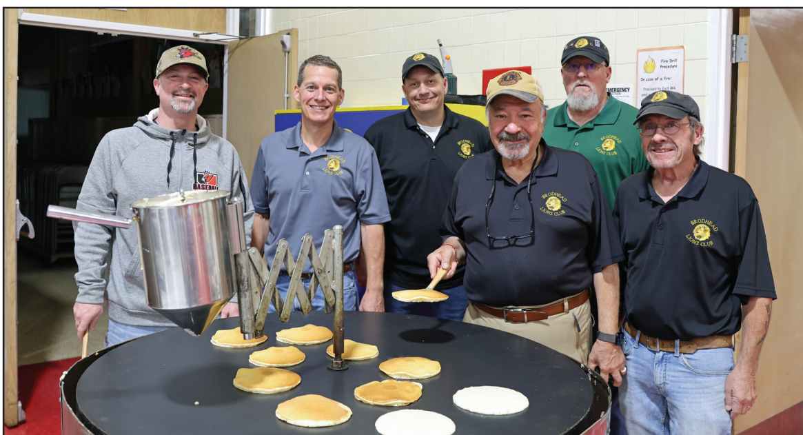
A few members of the Brodhead Lions organization working their annual spring breakfast event. Proceeds from this event help Fund field trips for students at Albrecht Elementary School.

As we look ahead, we encourage everyone to remember and support the local organizations and businesses that step up to make community events possible.