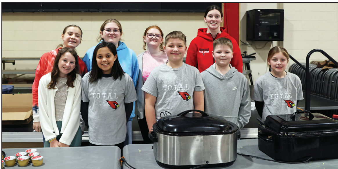
Students of the T.O.O.L. team with assistance from some High Schoolers helped serve at the pancake breakfast last Saturday.