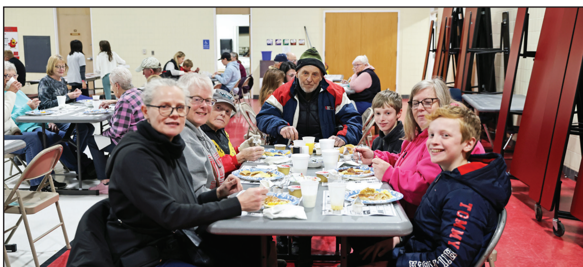
Families and people from the community came out to the Lions pancake breakfast on Saturday.