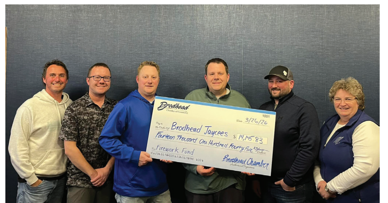
The Brodhead Chamber of Commerce recently voted to donate the funds collected over the years from the community can drive to the Brodhead Jaycees who have agreed to administer the finances of the fireworks.

The Chamber has great respect for the Jaycees and their long history of community involvement. We are confident the organization will manage the funds responsibly and continue to support the traditions that make Brodhead such a special place to live and celebrate.