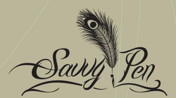
"Blending, Arts, Education & Community"

Check out our website at <u>www.SavvyPen.com</u> and follow us on Facebook to see our latest projects!