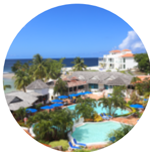
WINDJAMMER LANDING VILLA BEACH RESORT SAINT LUCIA

Book by: 10/31/2024 | Travel: 11/1/24 - 5/31/25