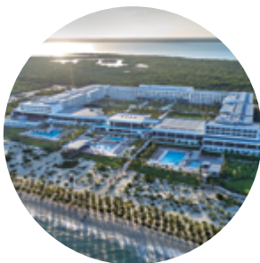
RIU PALACE COSTA MUJERES CANCUN