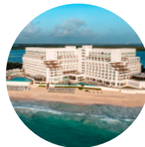
SUN PALACE CANCUN

Book by: 10/20/2024 | Travel: Now - 4/30/25