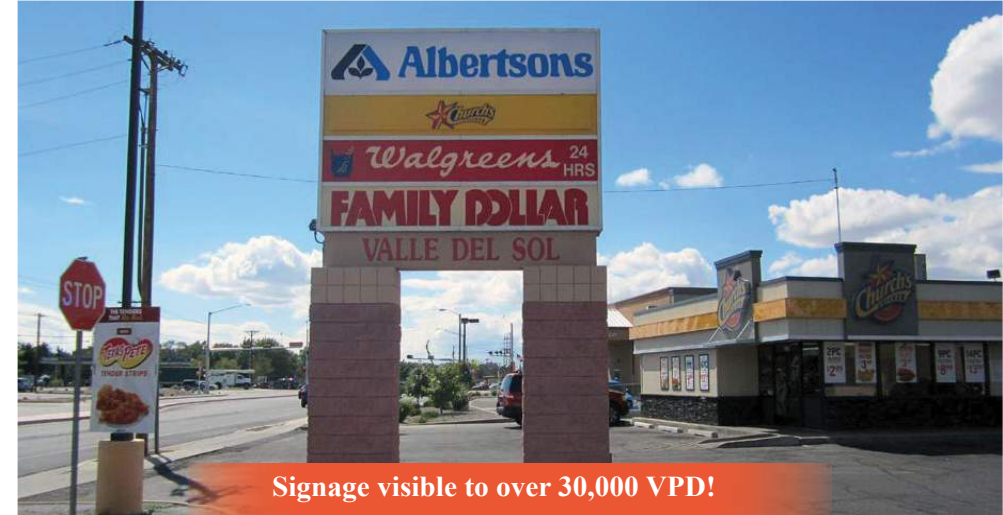
Signage visible to over 30,000 VPD!

This information has been obtained from sources believed reliable. We have not verified it and make no guarantee, warranty or representation about it. Any projections, opinions, assumptions or estimates used are for example only and do not represent the current or future performance of the property. You and your advisors should conduct a careful, independent investigation of the property to determine to your satisfaction the suitability of the property for your needs.