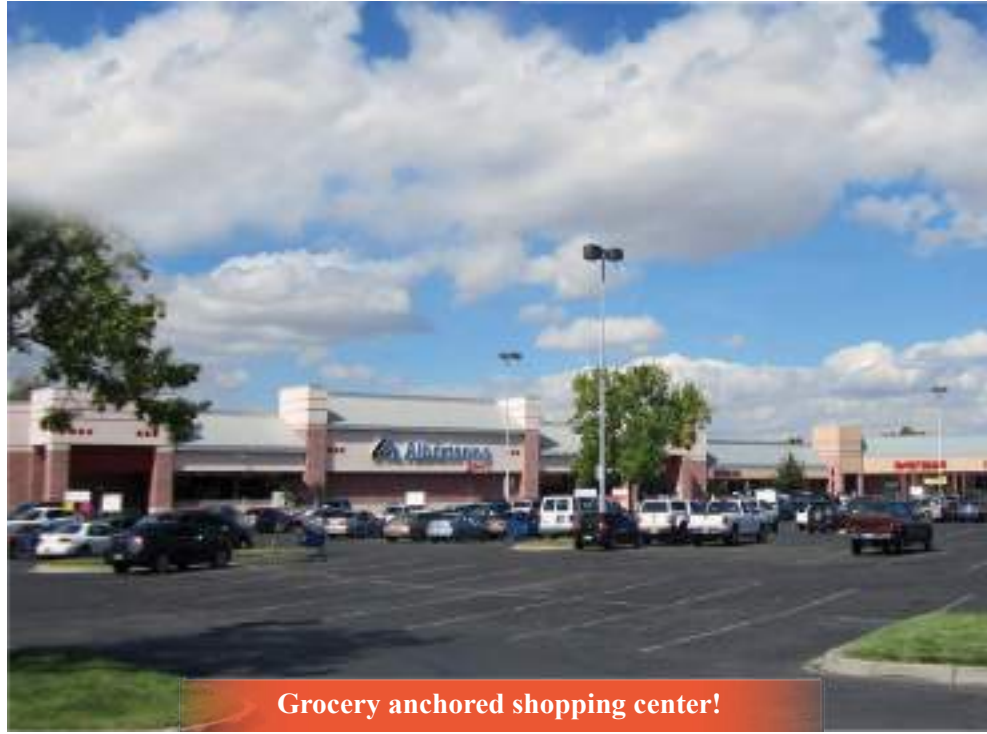
Grocery anchored shopping center!