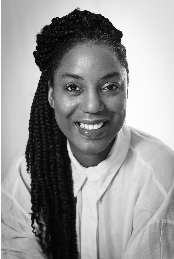
Engineer, Innovator, Board Member & Speaker