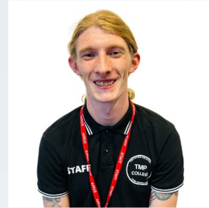
Vice Principal (MIS)