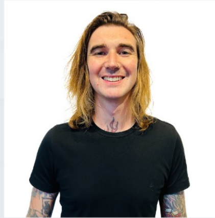
Principal & CEO