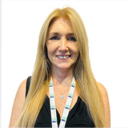
Vice Principal (Curriculum & Quality)